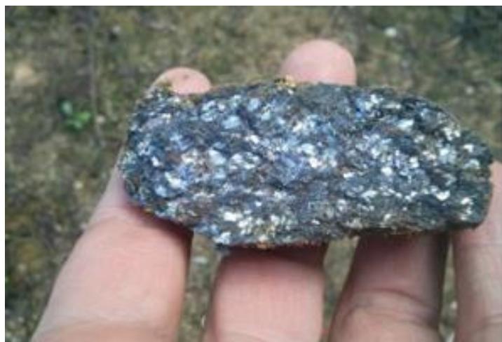
Figure 3: Very-large flake graphite from Seosil Graphite Project